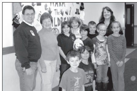
Yough Glade Elementary School students collected donations for Warm the Children, a program co-sponsored by the Oakland Civic Club and the Republican Newspaper.

The Headquarters Committee maintains our clubhouse (Steiner House) and last year welcomed visitors to our beautifully decorated home and summer kitchen for the annual Frederick Museums by Candlelight Tour.