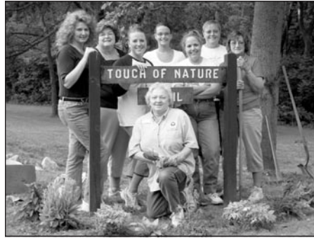
Western Maryland Community Club members planting flowers at the Rocky Gap State Park Handicapped Trail.

In May we assisted the Junior Women's Civic Club with their