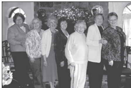
Members of the GFWC Centennial Club of Western District attending their spring meeting and luncheon.

The GFWC Junior Woman's Civic Club of Cumberland has had a busy year reaching out to help in our community. Our fall was filled with holiday activities: Salvation Army bell ringing and holiday stockings in November, hosting our 4th annual Santa's Workshop and wrapping gifts to benefit Toys for Happiness, hosting our annual holiday auction to build funds for our college scholarship, and continuing our adoption of the young teen girls at the Allegany Girls Group Home through Halloween bags and holiday gifts. We made Christmas happen for nine girls, many of who had never received a gift from their family. The caregivers of the home shared that the girls were astounded to see so many presents just for them and