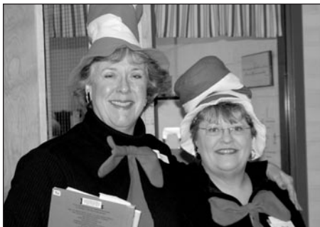
Members of the Woman's Club of Westminster preparing to for Dr. Seuss Reading Days to promote literacy.

and gift cards. Two members of our Home Life Department are active members of the county's council to stop Domestic Violence.