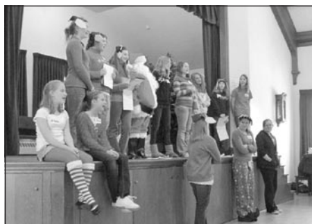
The STARS performing an original play, "Have You Been Naughty or Nice?" at their 14th Annual Santa's Workshop.

Club members organized the 5th Annual Chili Cook Off in October.