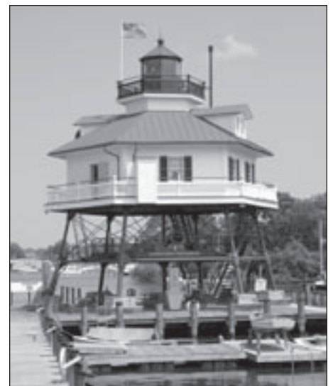
Drum Point Lighthouse

The deadline for reservations is September 15, 2009. When making your reservations, please remember to state if you will be attending the tour of the museum in the afternoon.