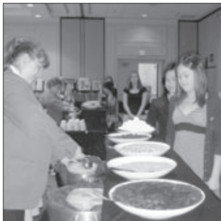
The Sundae Bar was enjoyed by all.