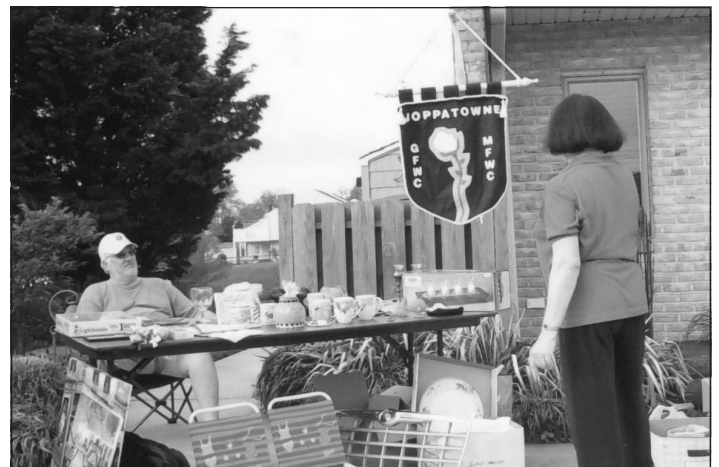
Joppatowne Woman's Club advertising their yard sale with their club banner.