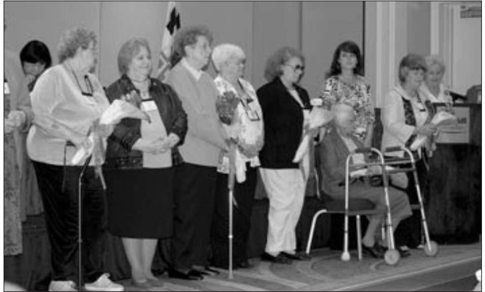
Some of the nominees for the Outstanding Maryland Clubwoman award... And they are ALL Winners!