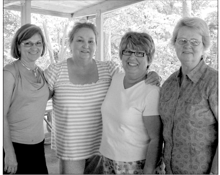
New Members of the GFWC Wicomico Woman's Club.