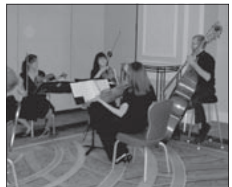
The Amaryllis Chamber Players String Quartet entertained at the "Passionate About Purple" Banquet.