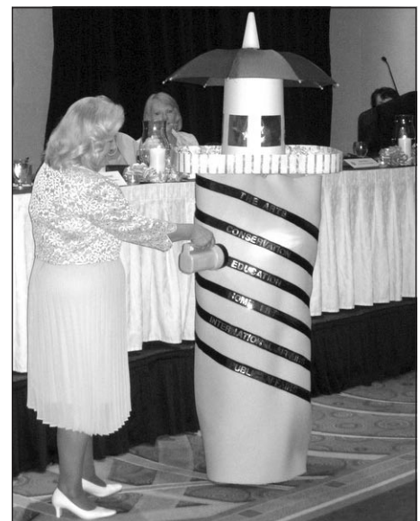
The Eastern Shore District Report—Yes, there is a live person in that lighthouse!