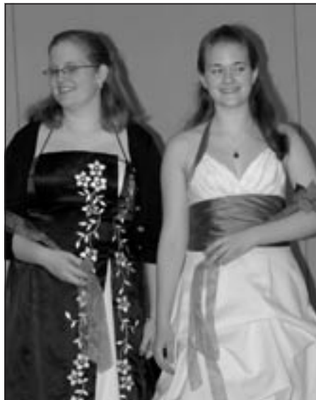
The Stars Juniorettes processing for the "Silver & Gold" Banquet.