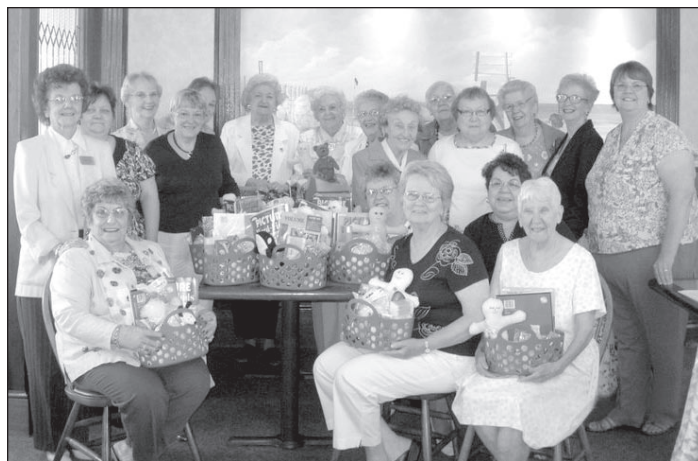
Cecil County Woman's Club members join other Eastern Shore District members to prepare centerpieces for SER.