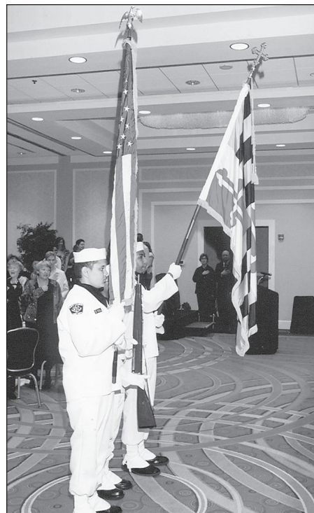
The Presentation of Colors by the Navy League Cadets.