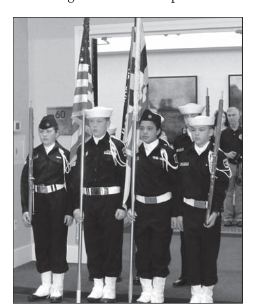
GFWC-MD Convention opened with the Presentation of Colors by the Navy League Cadets.