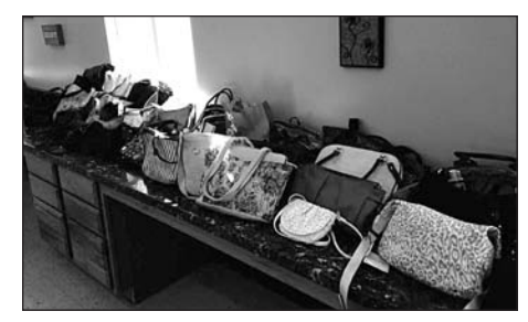
The GFWC Junior Woman's Club of Westminster participated in the Western District "Purses of Promise" project.

and taught members how to prepare the dishes that were served. The Culinary Arts Program trains students for careers in the food service industry and is certified by the American Culinary Federation.