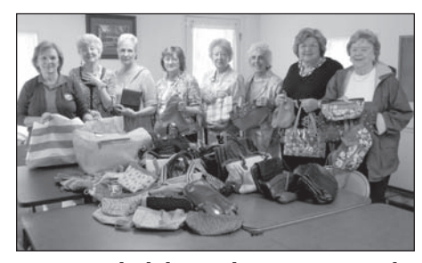
Centennial Club members participated in Western District's "Purses of Promise" project by donating, filling and distributing 66 purses to domestic violence shelters in four counties.