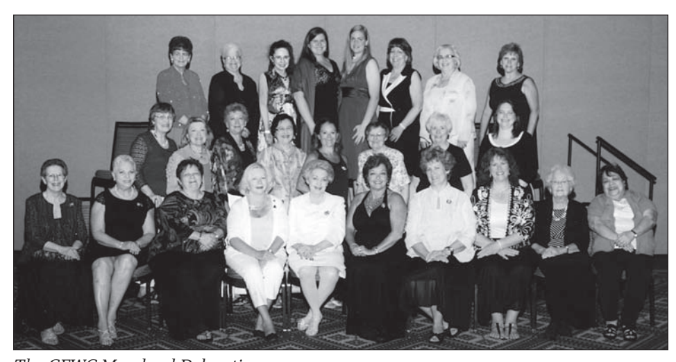
The GFWC Maryland Delegation.