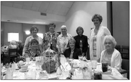
Members of the GFWC Woman's Club of Westminster, Inc. attending their Spring Luncheon.

In the spring, members participated in a fundraiser for the club and the Carroll County Career and Technology Center. Students in the Center's Culinary Arts Program prepared and served a delicious luncheon,