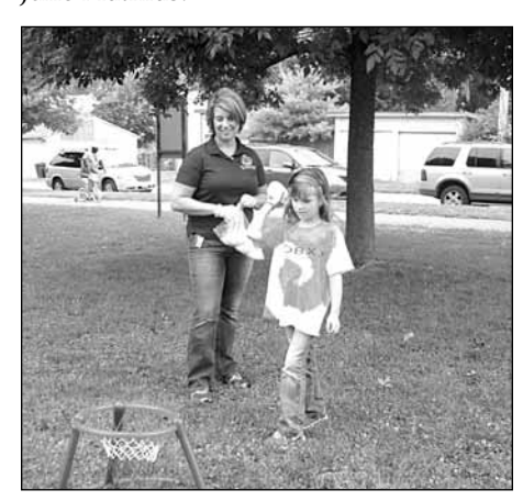
Local kids enjoyed games sponsored by the Westminster Juniors at Westminster's National Night Out.