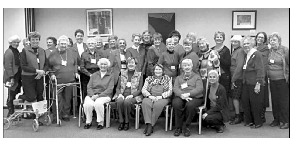
Members of the Woman's Club of Westminster all dressed in red for Heart Health Month in February 2013.

We received a $50 membership grant from GFWC and are excited to use it as part of our "GFWC—Girl Friends Wine Club." We wanted to find a way for our members and friends to have a relaxing evening together to discuss many other topics that affect us. We often have so much business to conduct at a meeting that we lose site of other matters around us that