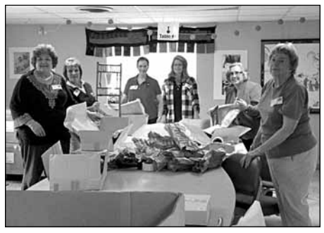
Centennial Club Members volunteer at the SERRV warehouse in New Windsor.

In October, our members returned to New Windsor, MD to volunteer at the SERRV warehouse. Members gathered to unpack huge boxes of Fair Trade items, inspect, count, and repackage the items for sale. Beautiful arts, crafts, clothing and even household goods can be purchased at their store or online to aid families and villages around the world. Our members are truly committed to "Living the Volunteer Spirit."