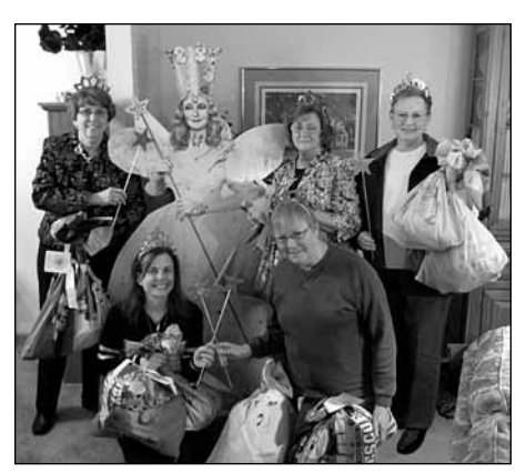
"A Gathering of the Good Witches"— WMCC members participated in GFWC Advocates for Children Week at their October Meeting and Halloween Party with the GFWC Pillowcase Project.

In October we celebrated all the "good" we do in our community with "A Gathering of the Good Witches." (Glinda the Good Witch was in attendance.) We participated in GFWC Advocates for Children Week with the GFWC Pillowcase Project. We purchased colorful kids pillowcases and filled them with small toys, books, stuffed animals, pajamas, etc. The pillowcases were tied with ribbon and a tag was