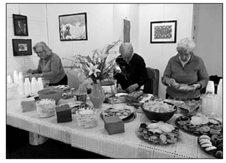
Members prepare refreshments for students and parents at the Cecil County Club's Annual Youth Art Show.

EASTERN SHORE DISTRICT REPORT —continued from page 21