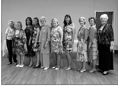
Cecil County Club Members serve as models for their Spring Fashion Show.