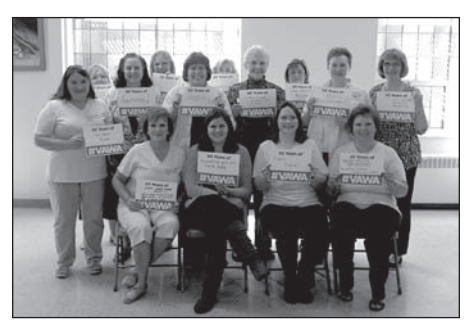
What does 20 Years of VAWA mean to you?