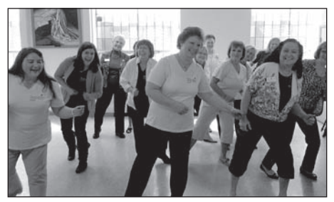
Doing the "Electric Slide"!

More Information will be included in the Official Call