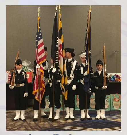
Opening Flag Ceremonies