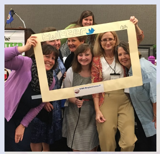
The Junior Executive Committee has fun on Junior Day