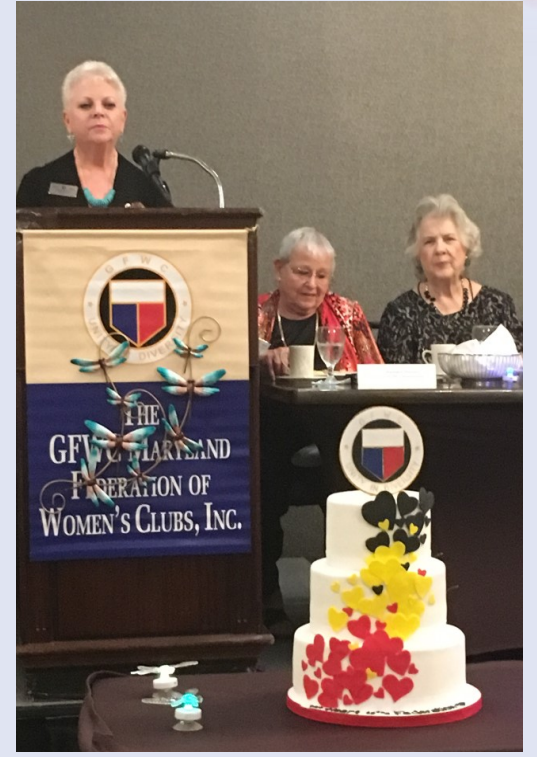
Special Thank You to the GFWC Maryland members for their hard work hosting the 2015 SER conference and the 2016 GFWC Convention!